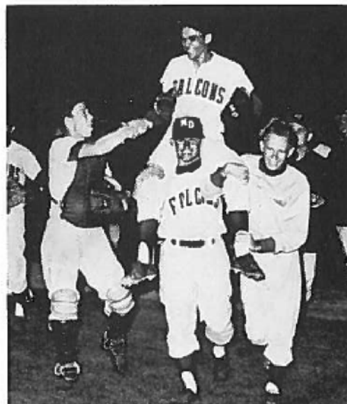
Jubilant Miami-Dade Wins 1964 National Title